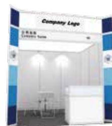
Premium Shell Scheme (min.9sqm)