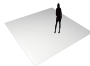
Raw Space (min.36sqm)