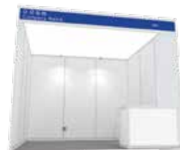
Shell Scheme (min.9sqm)